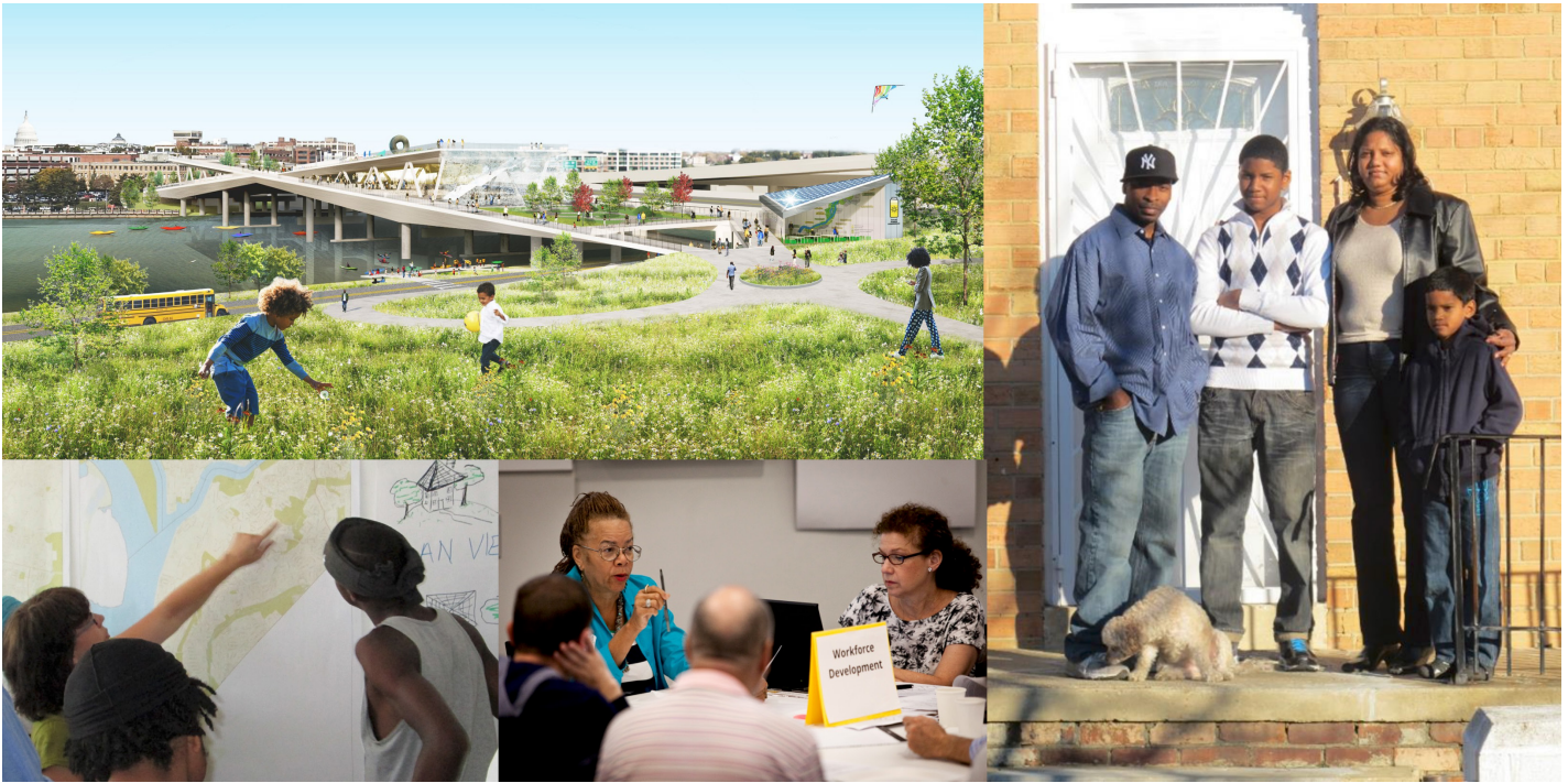
The 11th Street Bridge Park will span the Anacostia River between two very different communities in Washington, DC, and is seen by many as a model for the multidisciplinary approach and deep, long-term, community engagement necessary to ensure new parks contribute to equitable community development without gentrification and displacement.