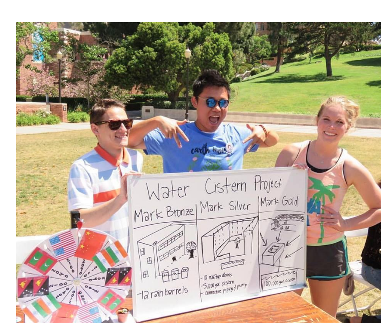
Resilience Team displaying three capture systems