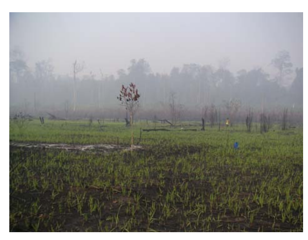
Post-fire Imperata growth.

Since fire has become prevalent in this area, I am field validating the accuracy of several fire products for Central Kalimantan. This involves recording the presence or absence of fires based on field observations and comparing this to remotely sensed data.