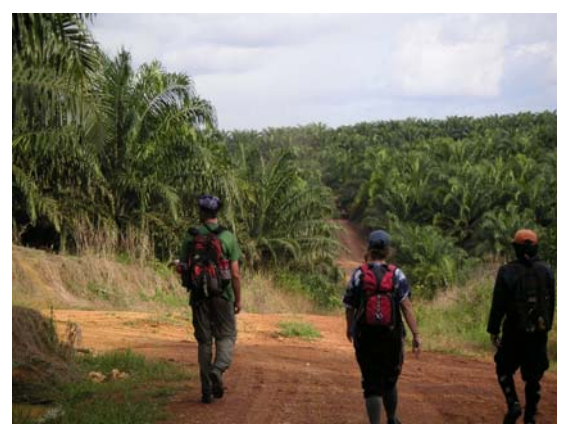
Palm oil plantations are one of the leading causes of orangutan habitat destruction and lowland forest loss in Indonesia. In the U.S., palm oil can be found in processed foods and health and beauty products.

The goal of my research is to assess natural and assisted successional patterns in an effort to develop feasible, large-scale restoration of Imperata grasslands to secondary forest. As deforestation rates increase and El Niño-related droughts in the area become more frequent and severe, it is essential to predict and prevent further degradation. To these ends, I am using a variety of techniques, including establishing a chronosequence of plots, root exclusion experiments, seed bank experiments, Geographic Information Systems (GIS), and remote sensing.