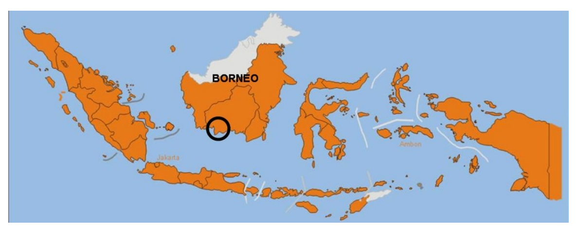
Map of Indonesia. The black circle indicates the location of Tanjung Puting National Park in the province of Central Kalimantan on the island of Borneo.

Lowland tropical rainforests are rapidly disappearing due to fire, logging, and agriculture. Research and restoration efforts are urgently needed, especially in understudied and underserved areas like Borneo. Borneo is the world's third largest island and is part of the Sundaland Biodiversity Hotspot. It is also home to many endangered species, including orangutans.